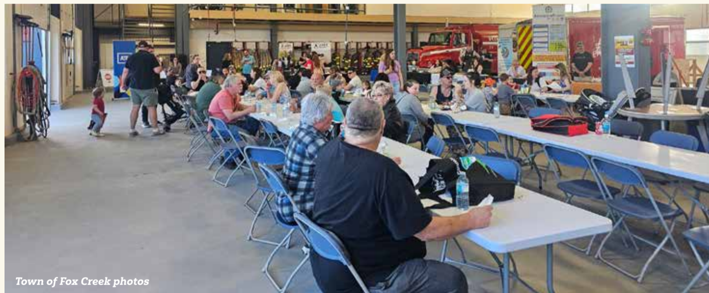
Town of Fox Creek photos