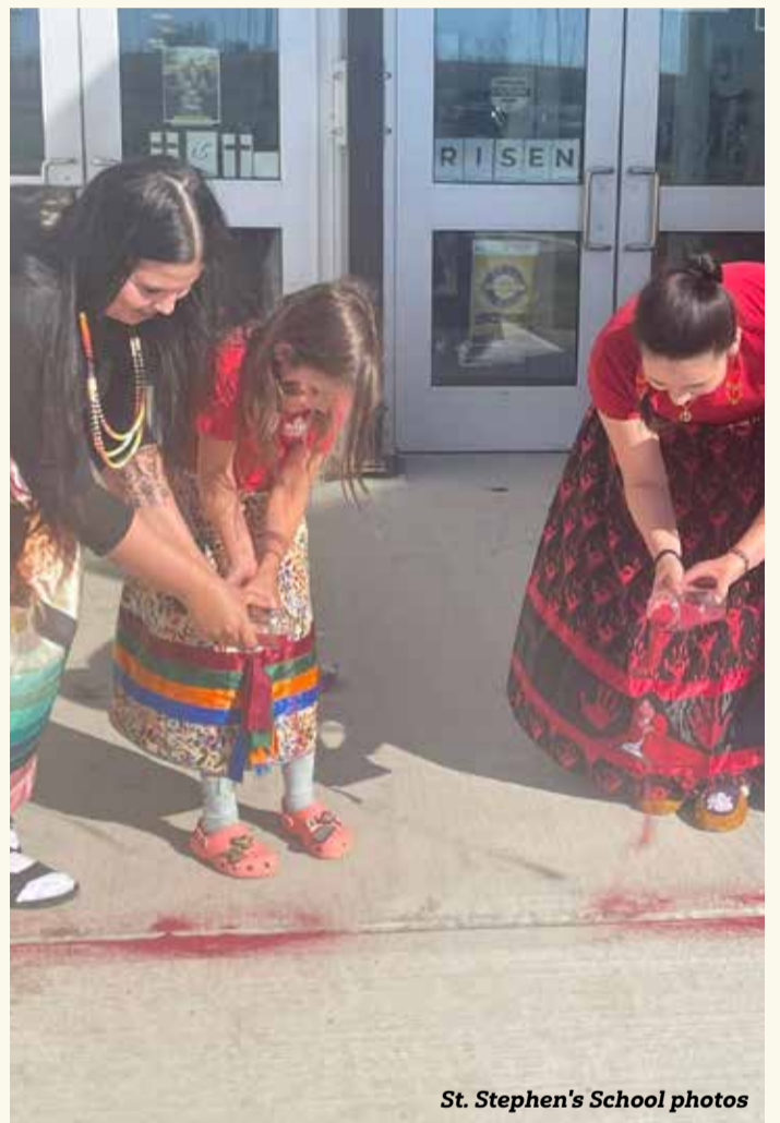
St. Stephen's School photos