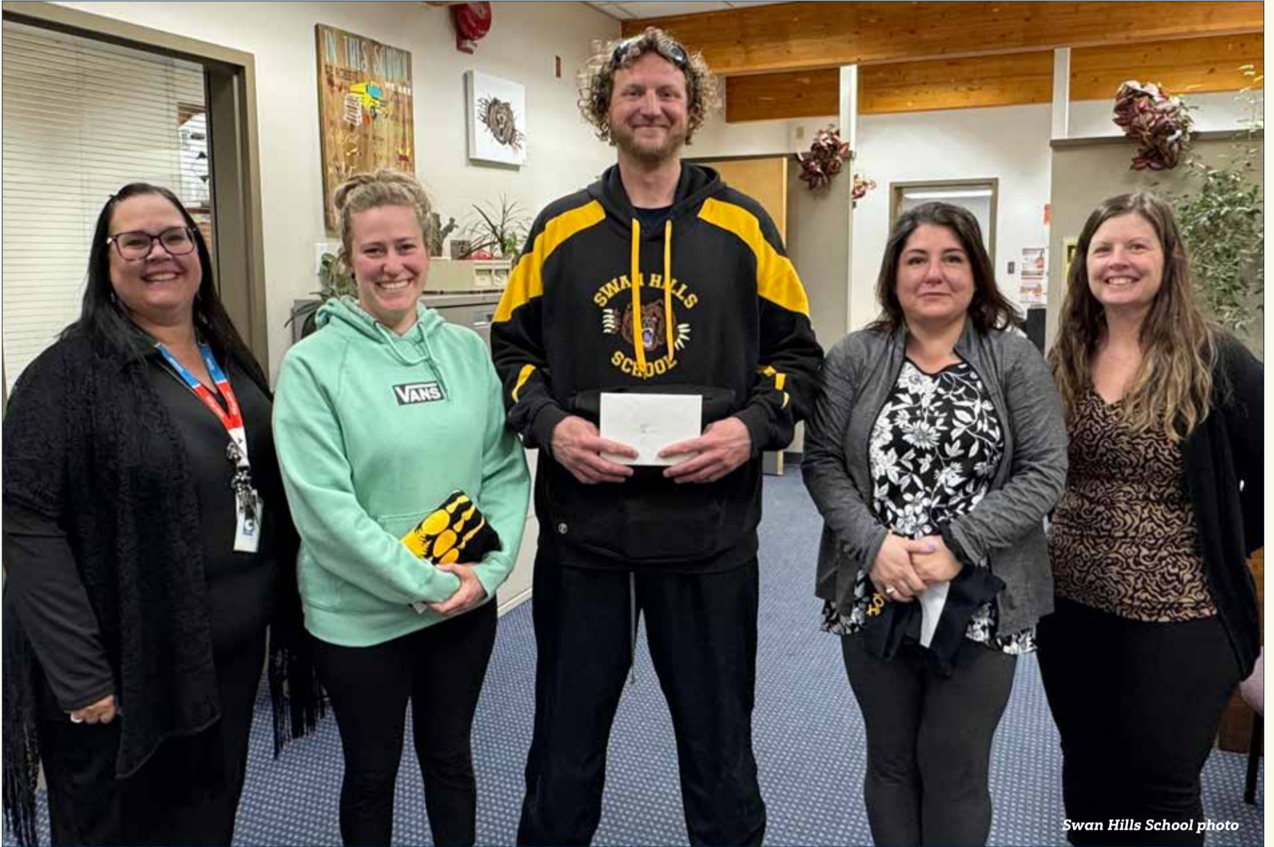
Swan Hills School photo