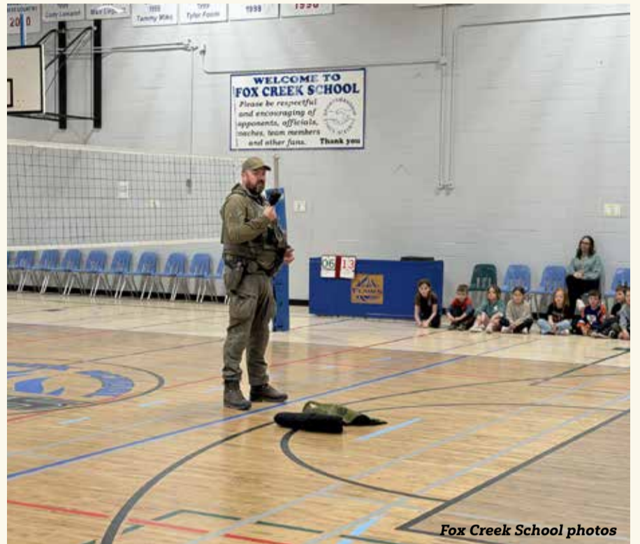
Fox Creek School photos