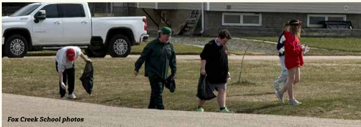
Fox Creek School photos